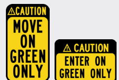
Salvo Sign Kit