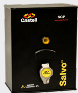
Salvo Control Panel (SCP)