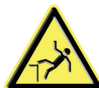
Fall from Heights