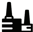
Power Generating Stations

Regardless of the industry, ESP's need to be properly maintained and the safety of personnel and the equipment is critical during maintenance operations.